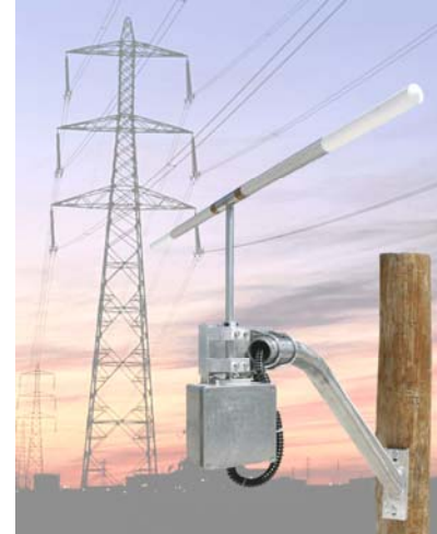
The ThermalRate™ Monitor (TRM)

The thermal rating of an overhead transmission line is the maximum current that the line can transfer without exceeding a specified conductor temperature. The rating is dependent on weather conditions such as wind speed and direction, sunlight, and ambient temperature.