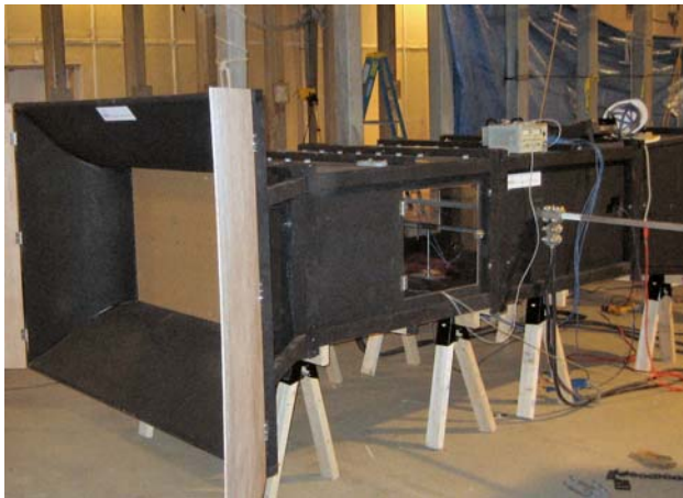
Wind Tunnel Testing

The TRM allows the transmission owner to capture this unused capacity by continuously determining the thermal rating of the line. The TRM is installed in the vicinity of the line and uses a conductor replica technique to determine environmental cooling conditions and then uses IEEE-738 formulas to determine the actual line rating.